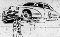
Bring Your "Know How" to put your car in first-class shape from a lubrication standpoint. The best lubrication service is loan made you no more than the ordinary kind.