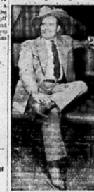
BOB WILLS An American success story that began in the heart of Texas is that of Bob Wills, handsome, genial leader of the nation's No. 1 Western music aggregation. Known as "Bob Wills and his Texas Playboys," this phenomenal dancing band, which recently toured Harry James in attendance, is coming to the Jersey Lilly for a two-day engagement Sunday and Monday, August 25-26.

Bob Wills and his Texas Playboys have been playing in Hill Country, West Texas, for many years. In 1935, they were the first to play in the Hill Country. They have since played in many other places, including the Jersey Lilly. They are known for their "Texas Style" music, which is a blend of Western and Swing music. They have a large following of fans, and their performances are always a hit. They are coming to the Jersey Lilly for a two-day engagement, and it is expected that they will be a big success. Their greatest annual triumph, were the rodeo called "Bob Wills Rodeo" put on for one week in the heart of the country. In 1935, they were the first to play in the Hill Country. They have since played in many other places, including the Jersey Lilly. They are known for their "Texas Style" music, which is a blend of Western and Swing music. They have a large following of fans, and their performances are always a hit. They are coming to the Jersey Lilly for a two-day engagement, and it is expected that they will be a big success.